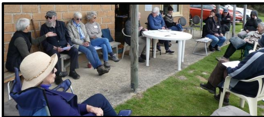
AGM image